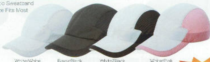
White/White Black/Black White/Black White/Pink