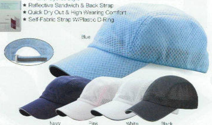
Blue Navy Pink White Black