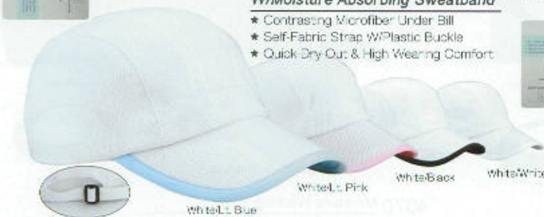
White/Lt. Blue White/Lt. Pink White/White