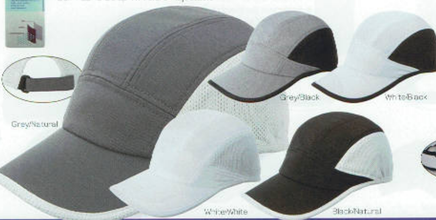
Grey/Natural Grey/Black White/Black Black/Natural