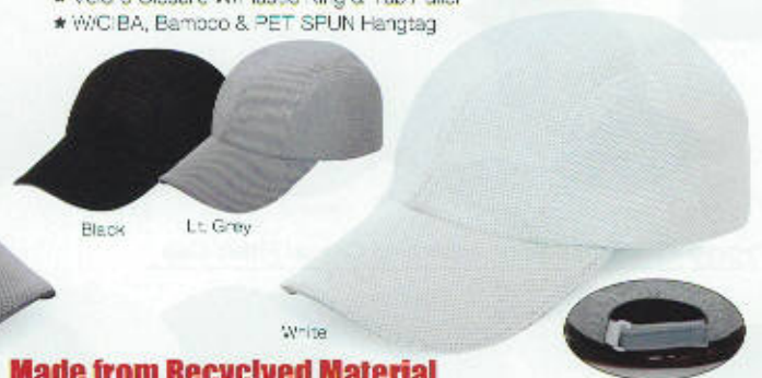
Black Lt. Grey White

Made from Recycled Material to Conserve Natural Sources Bamboo Charcoal Keeps Skin Cool and Comfortable