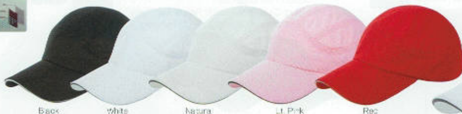
Black white Natural Lt. Pink Red