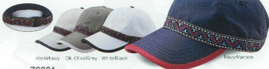
Khaki/Navy Dk. Olive/Grey White/Black