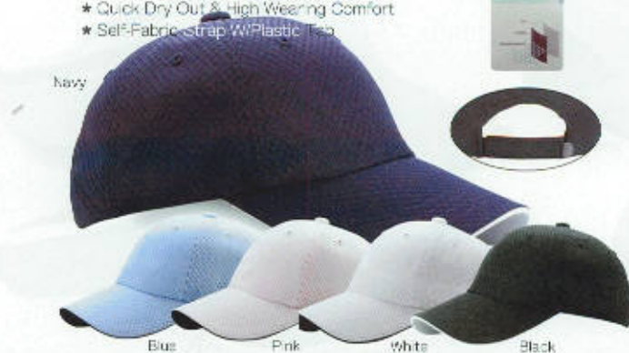
Navy Blue Pink White Black