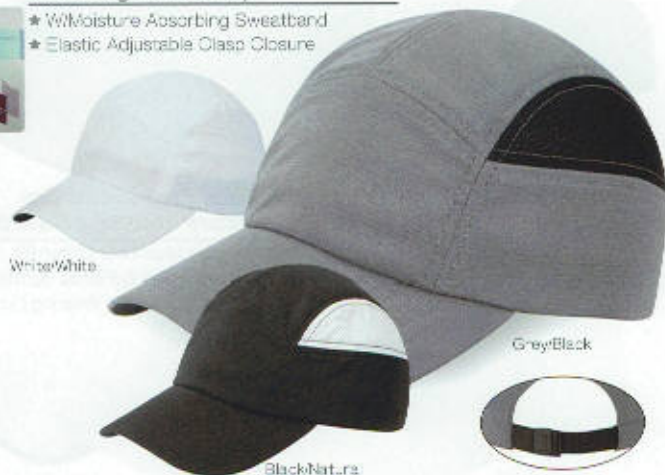
White/White Black/Natural Grey/Black