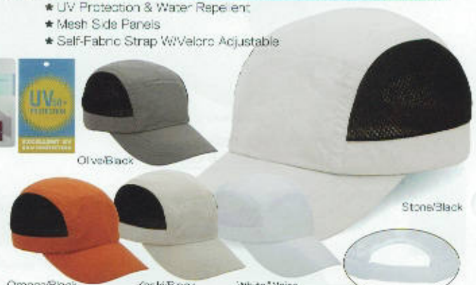
Olive/Black Orange/Black White/White Stone/Black