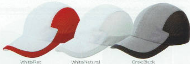
White/Red White/Natural Grey/Black