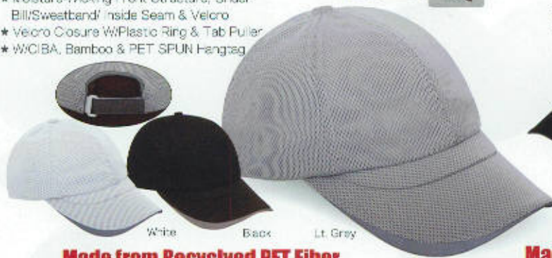
White Black Lt. Grey

Made from Recycled PET Fiber to Conserve Natural Sources Bamboo Charcoal Keeps Skin Cool and Comfortable