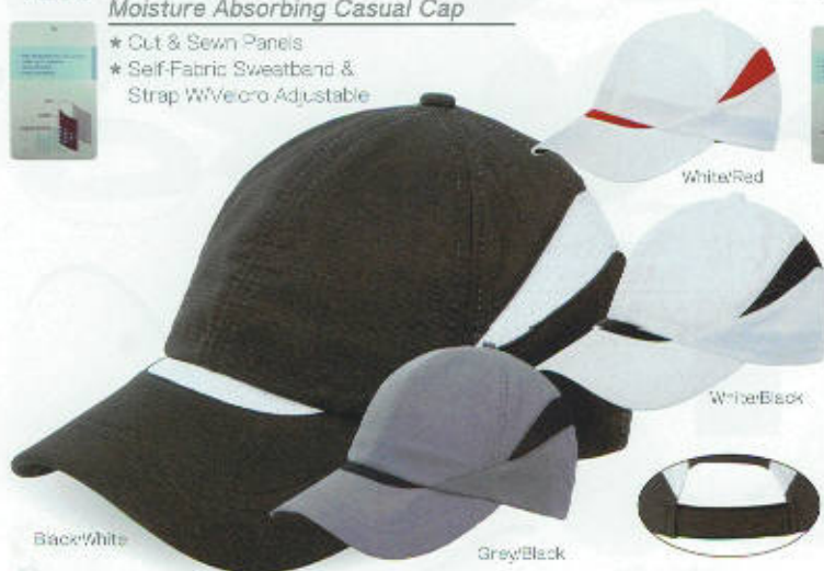
Black/White Grey/Black White/Black