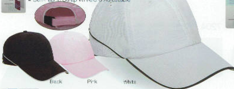
Black Pink White