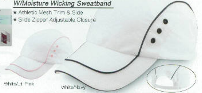
White/Lt. Pink White/Navy